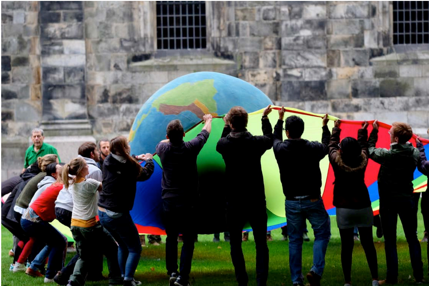
Climate does engage students!